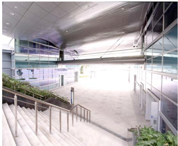
From Left: The Fullerton Hotel, One Fullerton