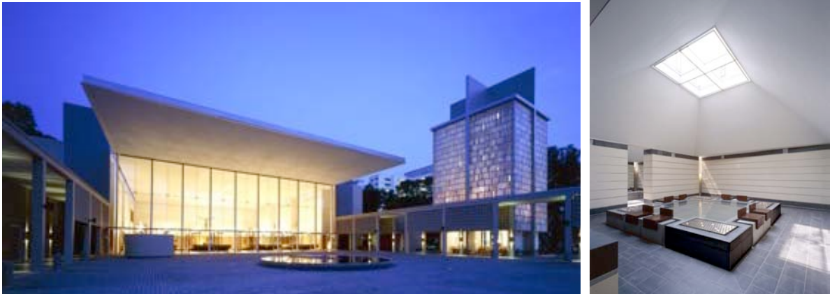
From Left: View of main courtyard, sanctuary and chapel, The Columbarium.