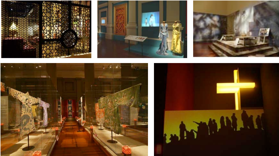
Top row from left: Nyonya Kebaya, From the Land of the Ottoman Sultans, Spirit of Wood Bottom row from left: Power Dressing, Journey of Faith